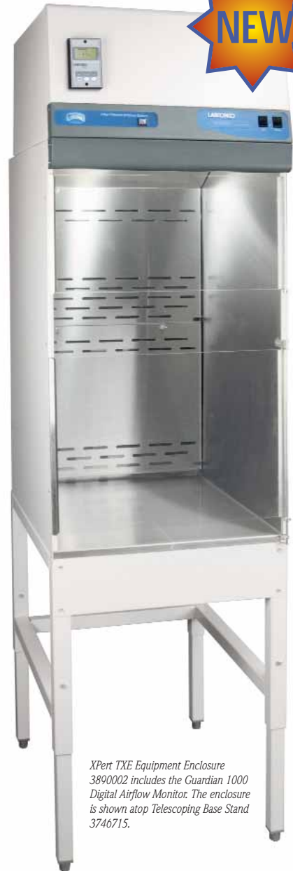
XPert TXE Equipment Enclosure 3890002 includes the Guardian 1000 Digital Airflow Monitor. The enclosure is shown atop Telescoping Base Stand 3746715.