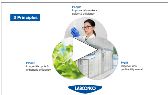
Sustainability Today for the Lab of Tomorrow