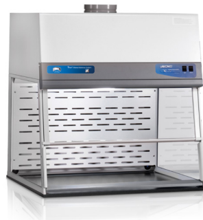
CVE Single HEPA (Exhausted)