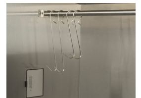
IV Bar Kits