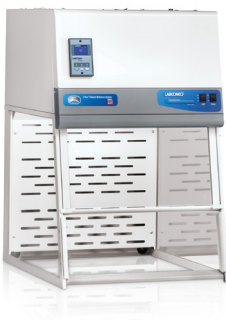
CVE Single HEPA (Recirculating)