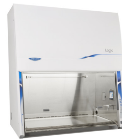
Class II Biosafety Cabinets Types A2, B2, and C1 (Exhausted)