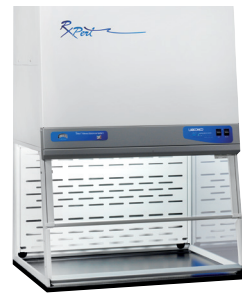
CVE Double HEPA (Recirculating)