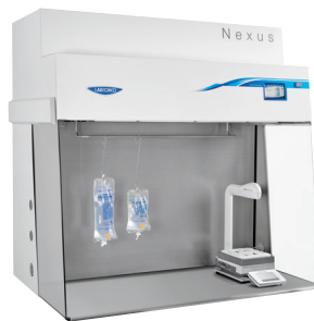
Laminar Flow Clean Benches Horizontal or Vertical