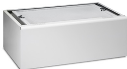
Double HEPA Conversion Kits